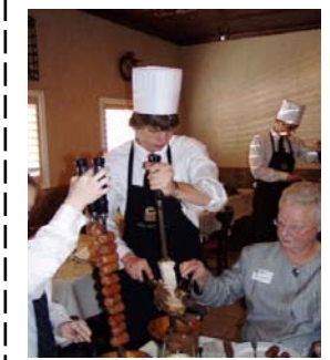
Superior service at Chabuca's